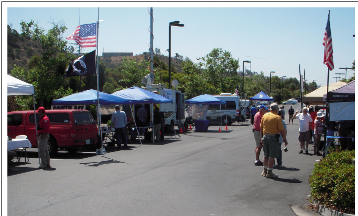
Radio Row at Fry's Murphy Canyon.

This was the fourth successive Fry's Ham Radio Operating event to take place in the past 2 years. The goals of the event are to expose the public to the benefits of amateur radio activities, to potentially stir interest in increasing public participation in amateur radio and to expose newly licensed amateurs to the various clubs and activities available in the area. The event is envisioned to take place semi-annually in the spring and late fall. Squelch Tales was fortunate to talk to many new hams looking for amateur radio related activities in which they could participate. There were also a number of budding but not yet licensed future hams that were interested in what activities were available and how they could become licensed. While there was a lot of information on local clubs and events, there was not a lot of information on training programs and VE testing – something to be considered for the next event.