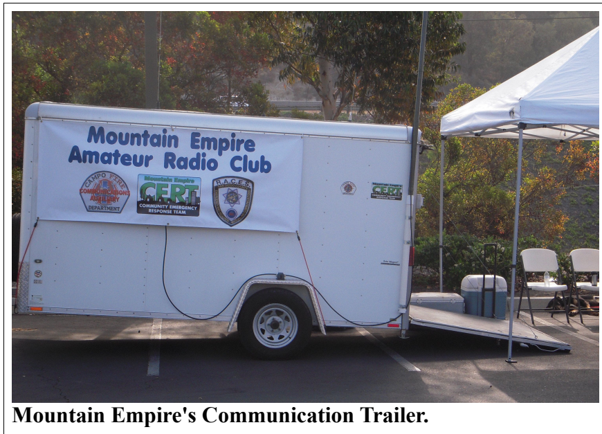
Mountain Empire's Communication Trailer.

increase our technical skills and knowledge of electronics as well as good operating practices for the increased enjoyment of amateur radio as a hobby. After all what you put into Ham Radio is what you get out of it.