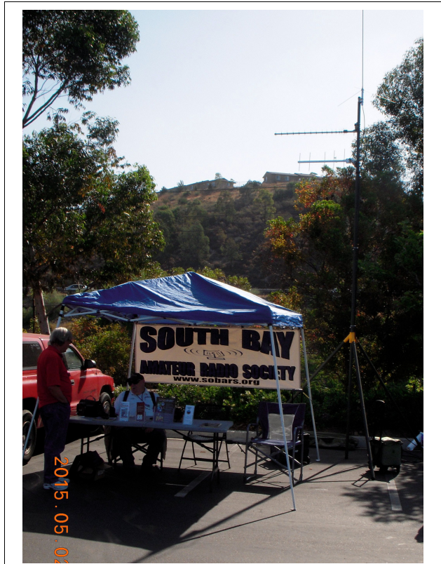
South Bay ARC booth.

The objectives of the Amateur Radio Club of El Cajon, Inc. (ARCEC) are to encourage the furtherance of amateur radio and allied interests; to foster public service by the amateur radio community; the development of acquaintances; to