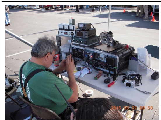
A Ham Operator.

The spring 2015 Fry's Ham Operating Day was definitely a success. This was the largest event yet at the Murphy Canyon location. The SANDRA team made many new contacts and renewed old contacts. There were a surprising number of new hams present which is representative of the growth that amateur radio is currently