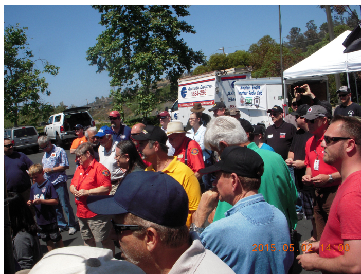
Did someone say prizes?

experiencing. Many of these new operators are not following in the footsteps of prior generations but utilizing the newer technologies and/or use amateur radio for a specific purpose. Events such as the Fry's Ham Operating Day give the organizations valuable input to steer future directions, besides, there was good fun, prizes, nice people and good information. Hopefully everyone that attended will be back for the fall event. -{SQ}-