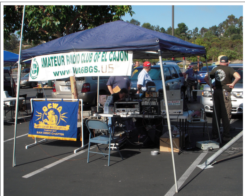
Amateur Radio Club of El Cajon.

Coronado Emergency Radio Operators (CERO) – The Coronado Emergency Radio Operators has the specific mission of supporting the City of Coronado's emergency communications needs. They specifically support the Coronado CERT team, Coronado Fire