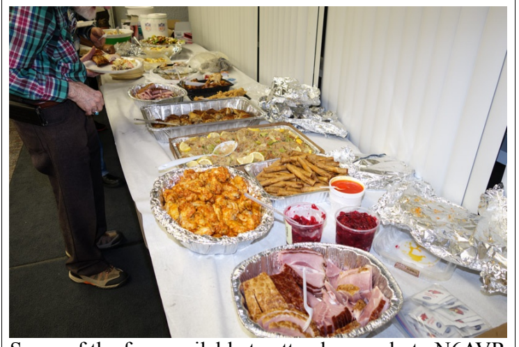
Some of the fare available to attendees