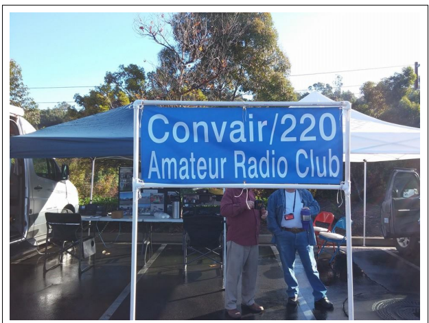
Convair 220 has been to each Fry's day.