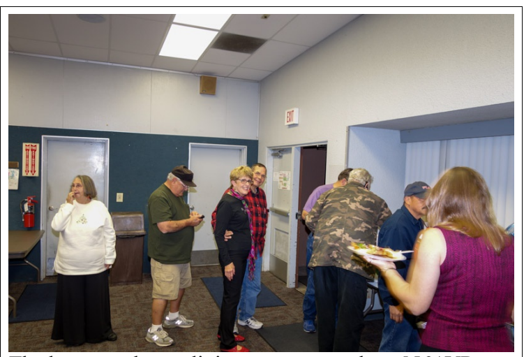
The hungary throng lining up to eat – photo N6AVR.