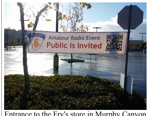
Entrance to the Fry's store in Murphy Canyon – photo by Joe Acevedo, N6SIX.