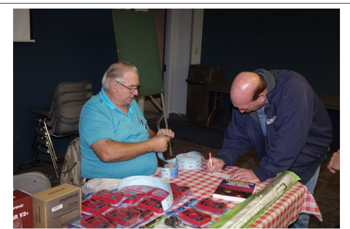
A land office business in ticket sales

December 4 marked the day of the SANDRA 2014 Holiday Party. This, the last SANDRA event of 2014 and a joint event with FILAMARAS, the Filipino American Amateur Radio Society, is traditionally the largest SANDRA membership meeting of the year, attracting nearly one hundred guests and filling the the large double room at the County Education facility on Linda Vista Road. The Holiday party represented the end of a busy SANDRA year as SANDRA members and Board members were heavily involved with the ARRL Convention held in San Diego this past September and also marked the installation of SANDRA's first digital repeater on Mt. Otay, this past summer. The meeting is a pot luck with additional SANDRA sponsored food; the pot luck contributions are the heart of the meal and certainly the most looked forward to by attendees each year, this year being no exception. The meeting is also one of the few times