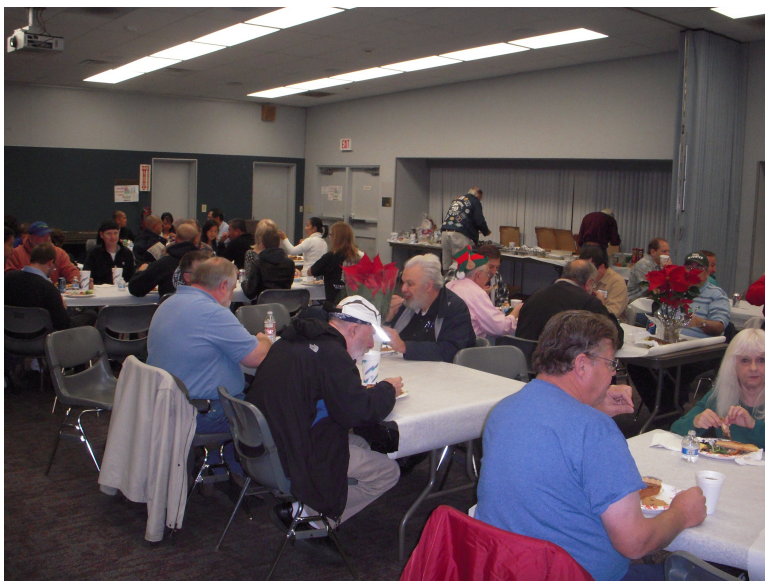
Guests start back for a refill