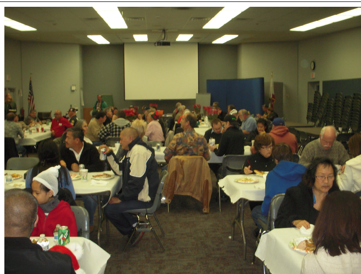
Munching and crunching.

This years Grand Holiday Party, the last event of 2013, was another spectacular success. The meeting which traditionally ends SANDRA's event year and introduces the new Board of Directors to the membership, is a joint meeting with FILAMARS, the Filipino American Amateur Radio Society, and is always well attended. This meeting is traditionally a pot luck with two large smoked hams sponsored by SANDRA. Because the meeting is so well attended, the variety of contributed dishes are a wonderful assortment of flavors all of which are available for sampling at one time. The meeting fills the large double room at the County Education facility on Linda Vista Road and for the first time in several years, it actually started on time.