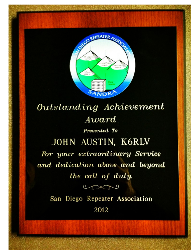
The Commemorative Plaque

benefit of buying additional tickets. In addition five people took poinsettias with them on the way home. Needless to repeat, attendees to this meeting arrive knowing that they will thoroughly