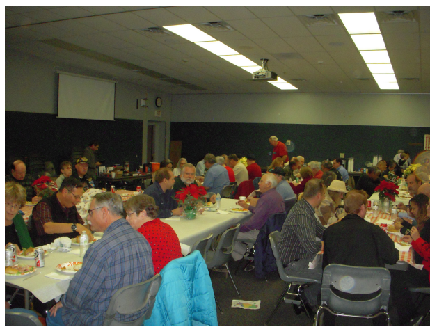
Good food and companionship